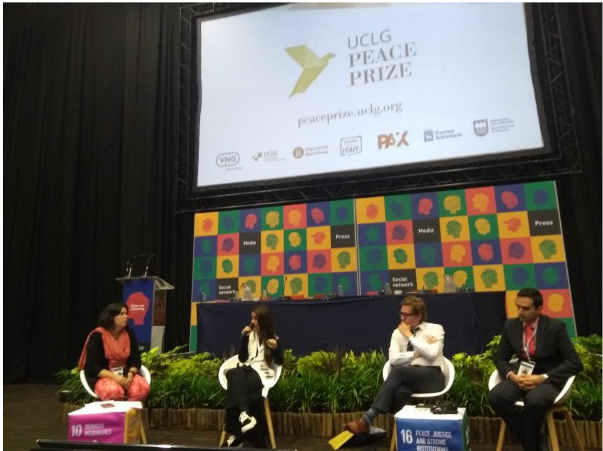
Learning session with Peace Prize finalist – UCLG World Congress 2019