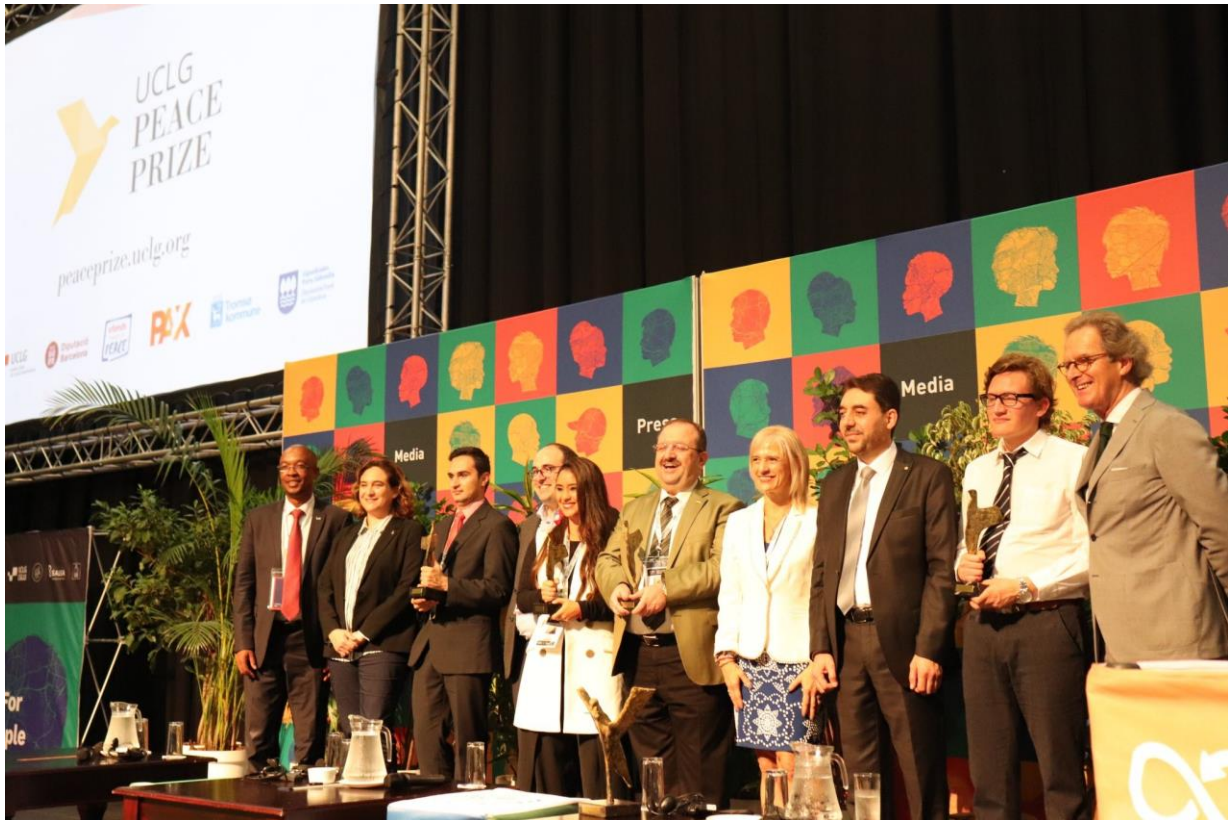
Award ceremony UCLG Peace Prize - UCLG World Congress 2019

sharing their initiatives so that others can learn from it in the future, both in online webinars and on international events. The award ceremony was reported on in many online news outlets, for example in El Pais , which reported on the initiatives of the winning municipality of Arsal.